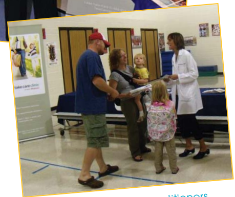
Take Care Clinic nurse practitioners at Back2School events